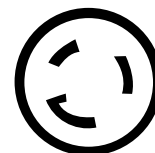
Nema L6-30 Twist